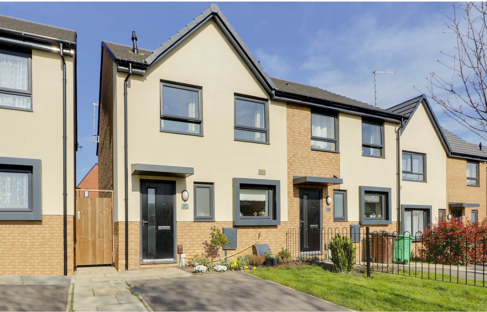
Pym Walk, St. Anns, Nottinghamshire NG3 2GP